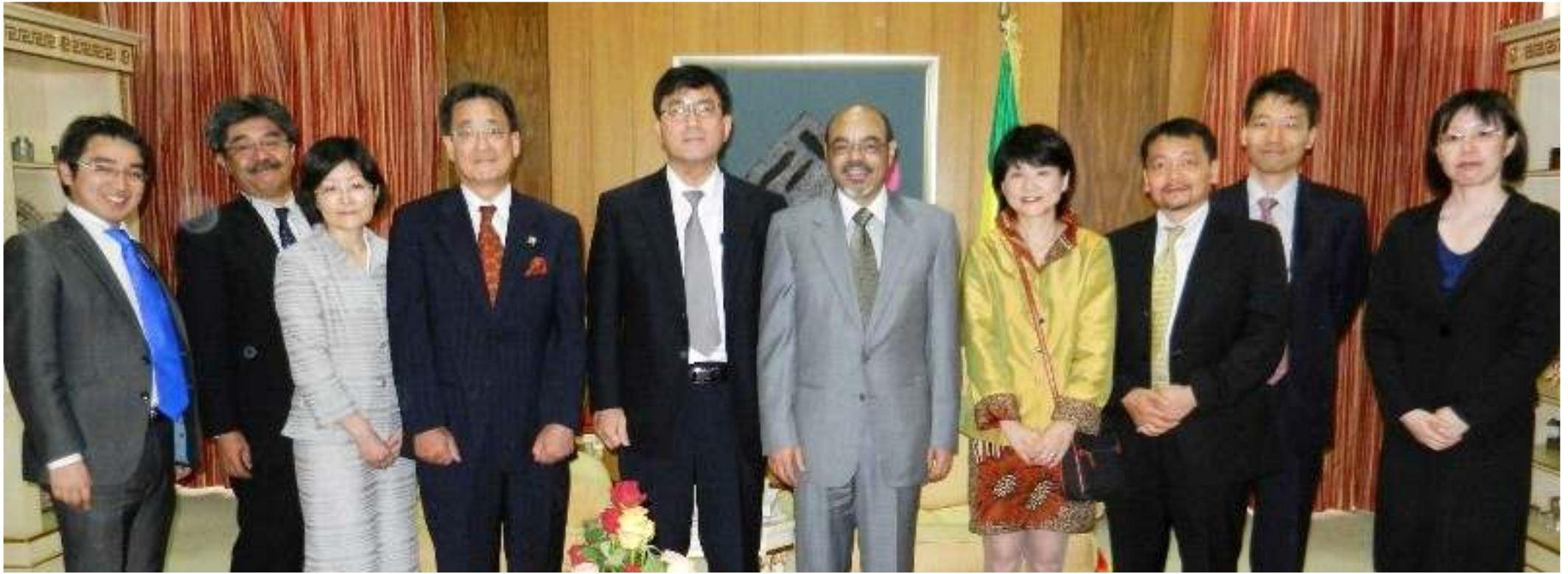
At the Prime Minister's Office