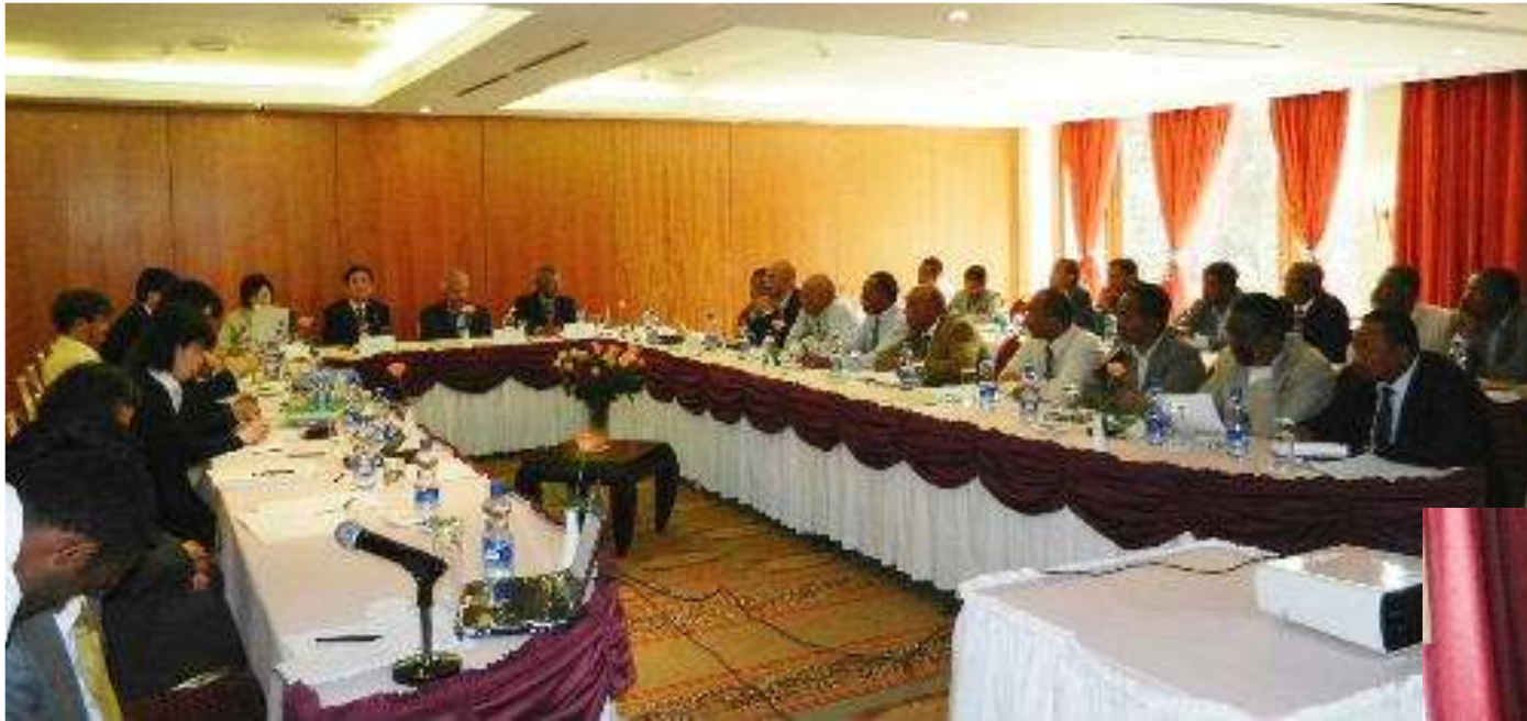
High Level Forum (minister & state minister level)