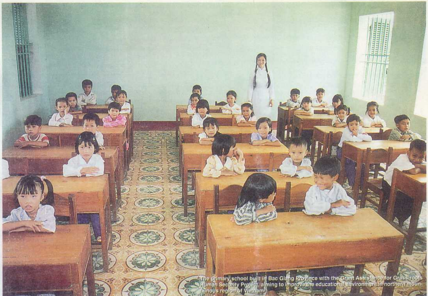
The primary school built in Bac Giang Province with the Grant Assistance for Grass-roots Human Security Project, aiming to improve the educational environment in northern mountainous region of Vietnam.