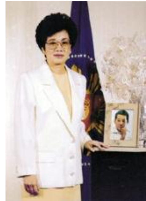
President Aquino 11 th President