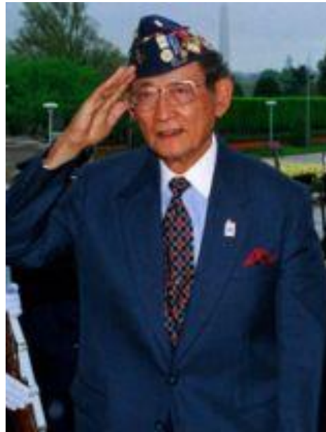
President Ramos 12 th President