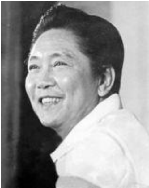
President Marcos 10 th President