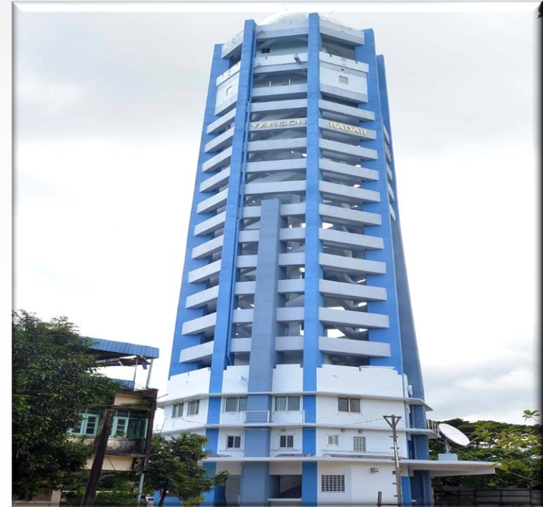
Yangon Radar Tower in 2016