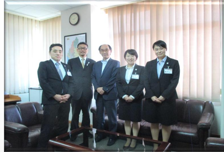
Japanese volunteers in 2018

Curriculum reforms at Primary Level in 2016