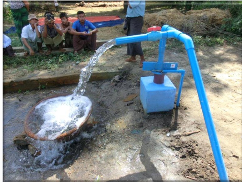
Provision of rural water supply in 2016